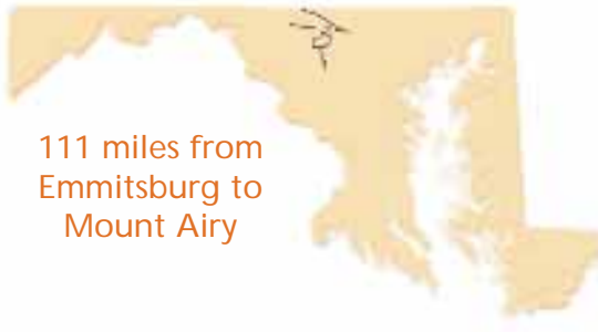
111 miles from Emmitsburg to Mount Airy

Follow the Catoctin Mountain byway (page 47) south along US 15 to