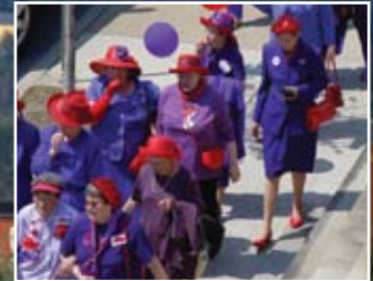
RED HAT SOCIETY