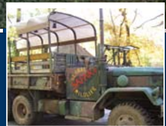
GLOBAL WILDLIFE SAFARI